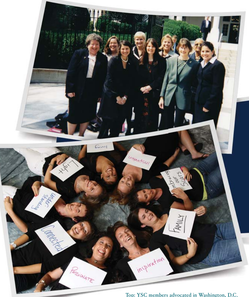
Top: YSC members advocated in Washington, D.C. Bottom: Volunteers at the 2012 Volunteer Summit

YSC began as a grassroots community and committed volunteers remain its strength. YSC will continue to be the champion for young women affected by breast cancer and work to ensure that no young woman faces breast cancer alone.